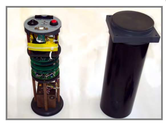
Figure 1: LEMI-026 system with and without hosing cover.

It may be used for autonomous measurements with moving carriers (drones) or being included in sea/land stations. There are two-components tilt-meter and GPS antenna inside allowing obtaining precise measurement timing, magnetometer coordinates, altitude and attitude during movement. These data are stored in the SD memory card.